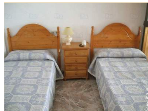
twin beds (standard)