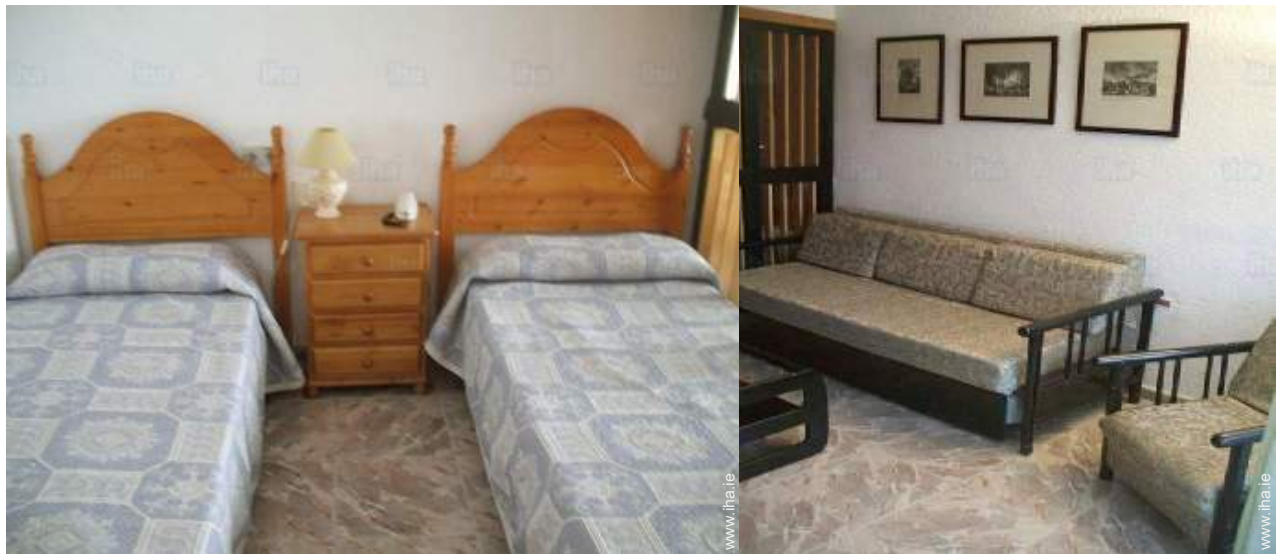
twin beds (standard)