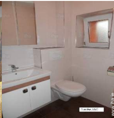
Dusche / WC