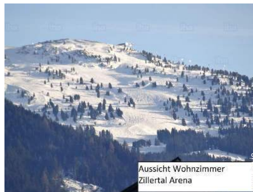
Aussicht Wohnzimmer Zillertal Arena