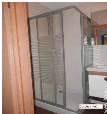
Dusche / WC