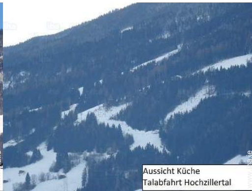
Aussicht Küche Talabfahrt Hochzillertal