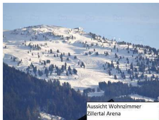
Aussicht Wohnzimmer Zillertal Arena