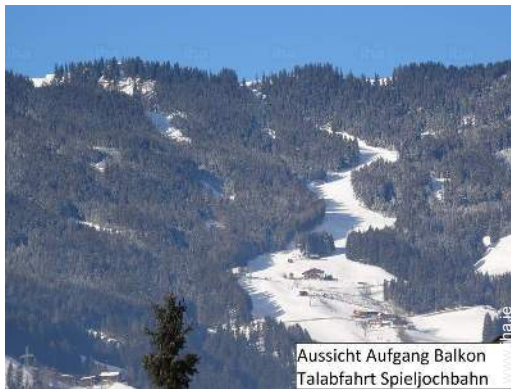
Aussicht Aufgang Balkon Talabfahrt Spieljochbahn