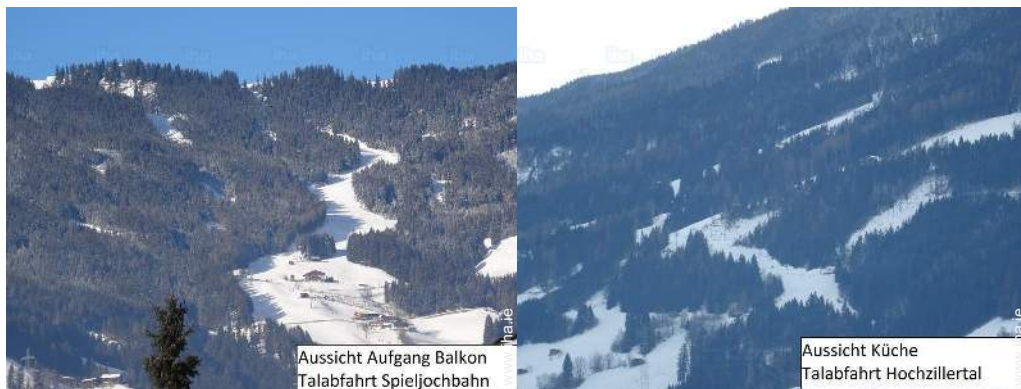
Aussicht Aufgang Balkon Talabfahrt Spieljochbahn