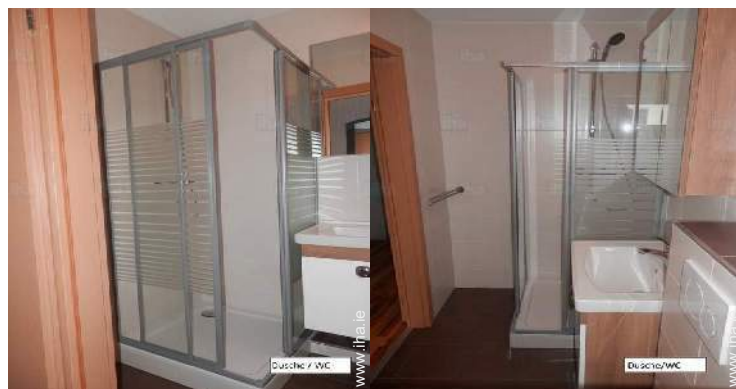
Dusche / WC