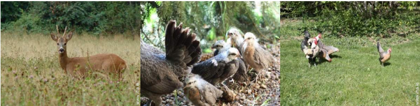
view over the countryside