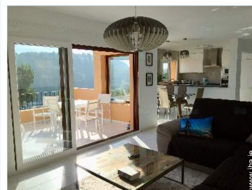
Interior layout and facilities

Village centre 2,5km Town centre 10km Bus stop / bus station 2km Bike/mountain bike hire 3km Car rental 2,5km Boat rental Scuba diving material hire Breadshop 2,5km Caterer 2,5km Local shops 2,5km Supermarket 2,5km High class retailers 2,5km Hairdressing salon 2,5km Internet cafe 2,5km Post office 2,5km Bank 2,5km Cash point 2,5km Chemist 2,5km Doctor 2,5km Nurse 2,5km Hospital 2,5km Dispensing clinic 2,5km