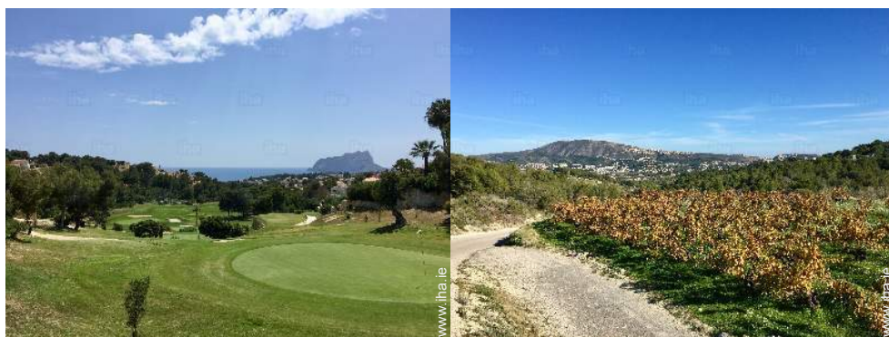
9 hole golf course