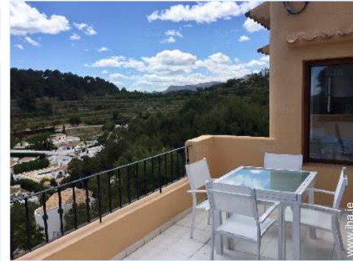
view over the mountain