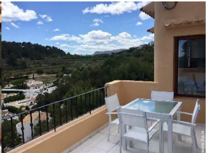
view over the mountain