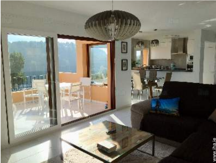
Interior layout and facilities