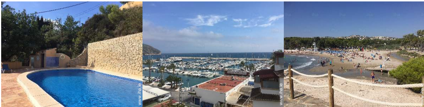
shared swimming pool