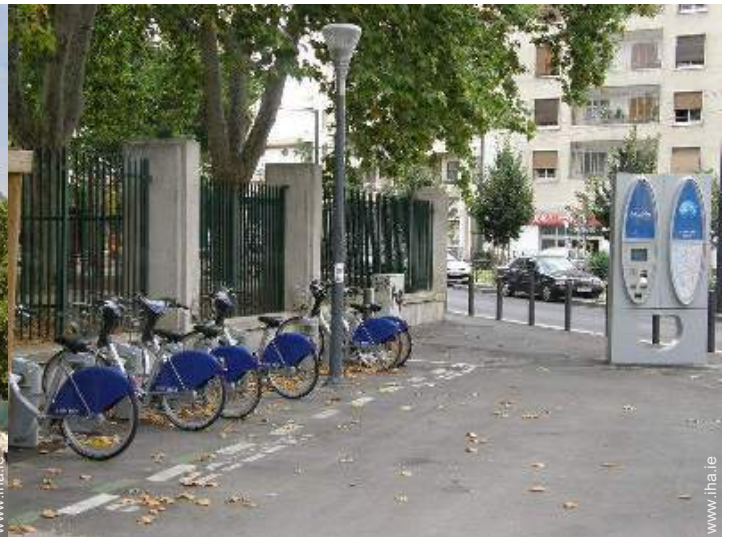
bike/mountain bike hire