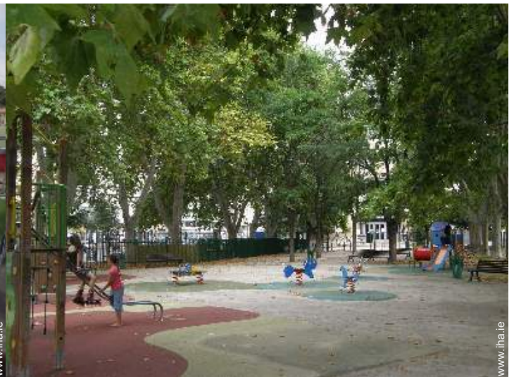
park and garden