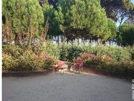
park and garden