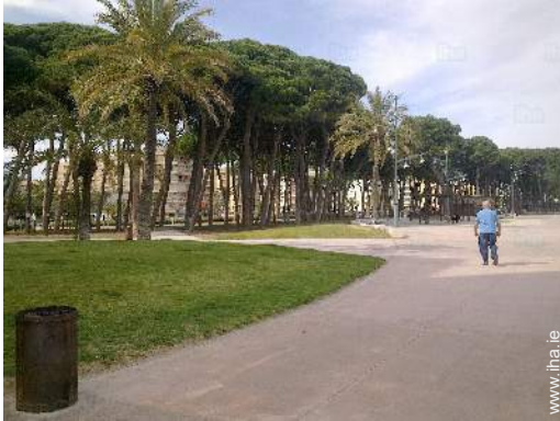
view over a pedestrianized street