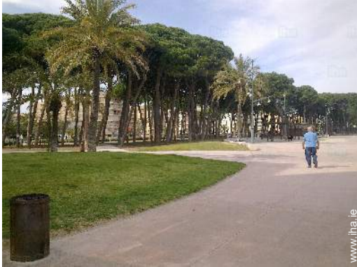
view over a pedestrianized street