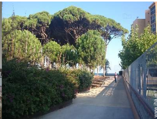
view over a pedestrianized street