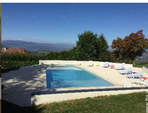
Heated swimming pool