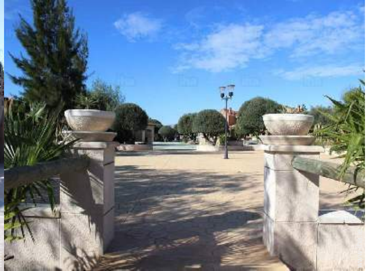
Equipment at the guest's disposal