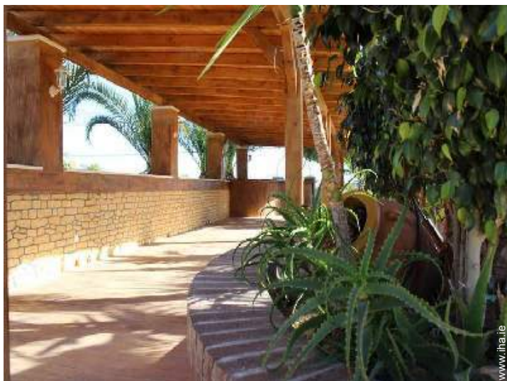
Equipment at the guest's disposal