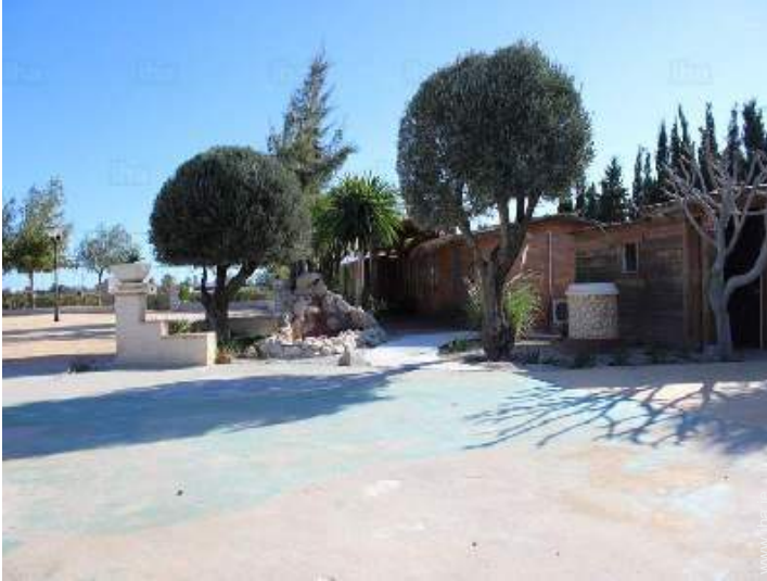
Equipment at the guest's disposal