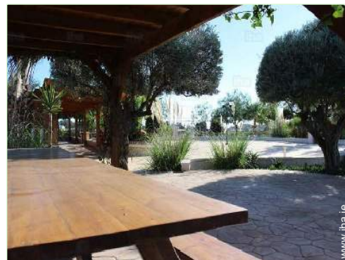
Equipment at the guest's disposal