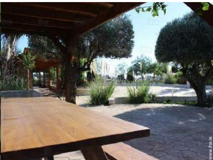
Equipment at the guest's disposal