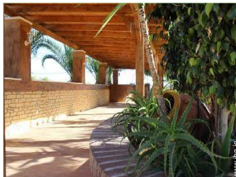
Equipment at the guest's disposal