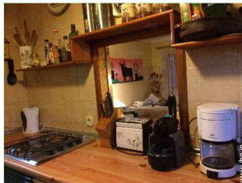
Interior comforts at guests disposal