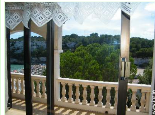
view from the kitchen

Sea/ocean <50m Sandy beach <50m Nudist beach 4km Public tennis court 800m 9 hole golf course 15km 18 hole golf course 15km Flying clubs >50km Windsurfing spots 15km Surfing spots 15km Watersports centre 5km Marina 5km