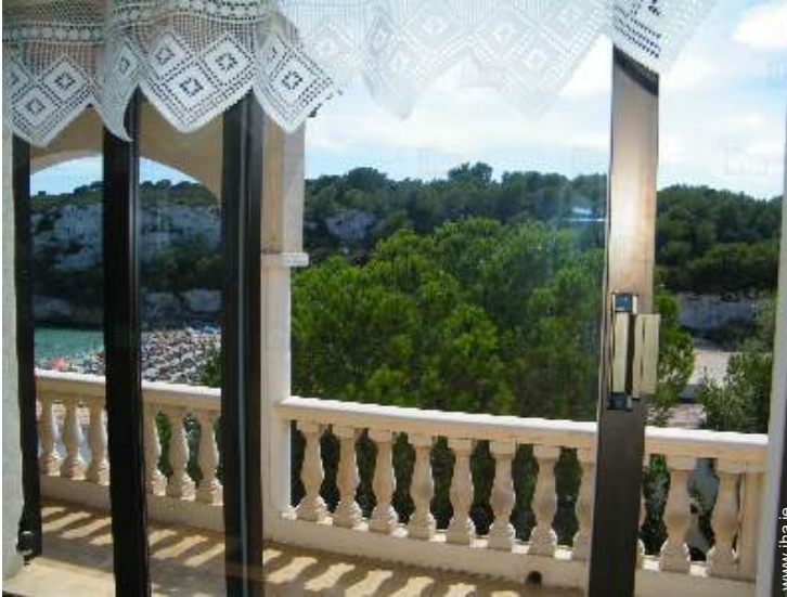
view from the kitchen