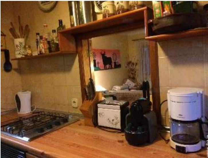
Interior comforts at guests disposal