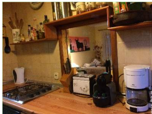
Interior comforts at guests disposal